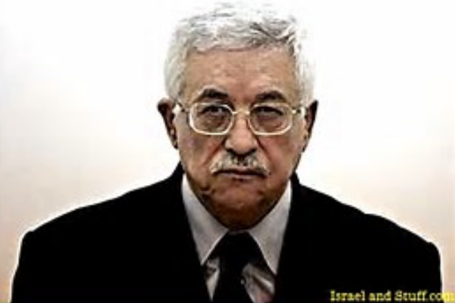
Mahmoud Abbas, to Egyptian media, 28 July

"I will NEVER allow a single Israeli to live among us, on Palestinian Land"