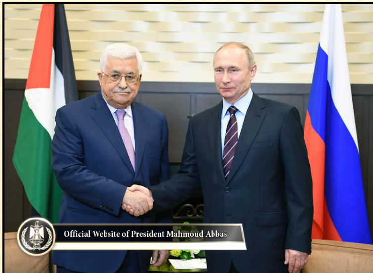
Official Website of President Mahmoud Abbas

The announcement comes as the PA is trying to convince Russia to play a much more prominent role in the peace talks, having declared the US unqualified to act as an “honest broker” due to President Donald Trump’s recognition of Jerusalem as Israel’s capital.