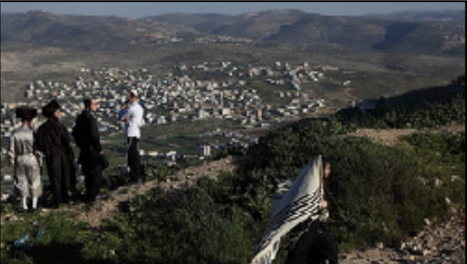
JEEP TOUR TO THE SYRIAN BORDER