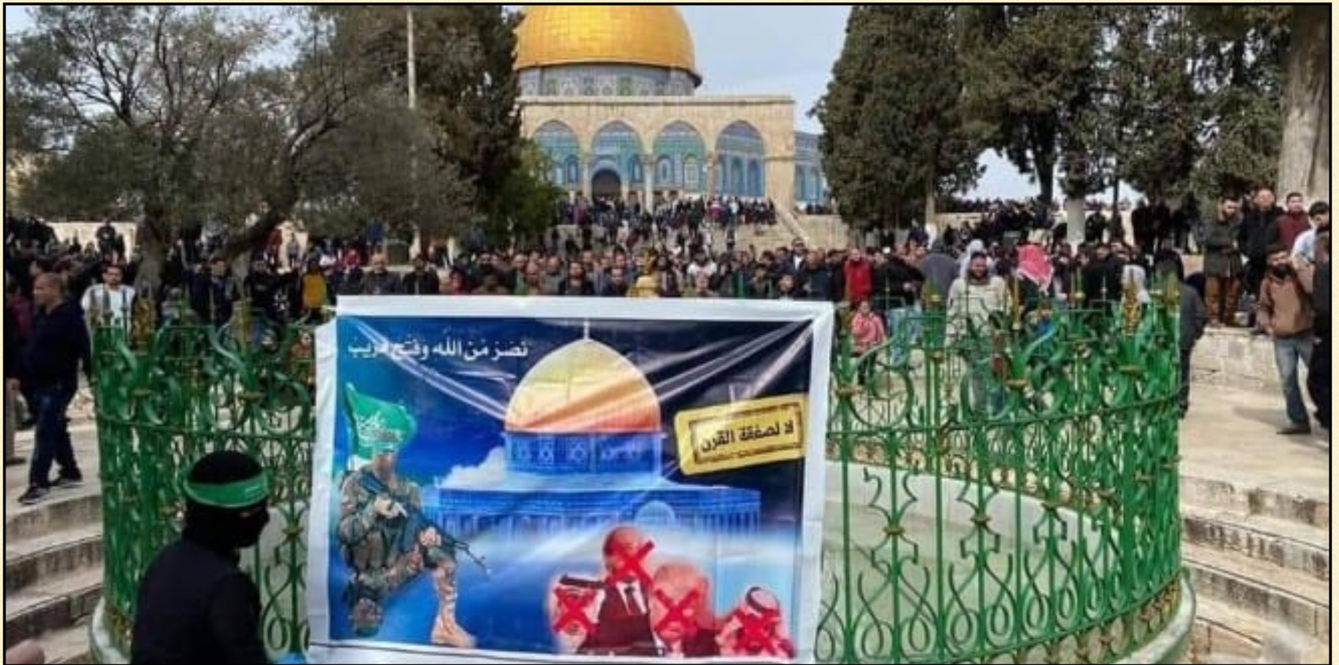
Poster of Hamas terrorist aiming gun at Trump's face on Temple Mount