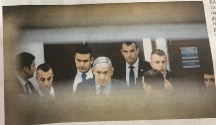
PRIME MINISTER Benjamin Netanyahu is seen after meeting with party leaders in the Knesset yesterday.

Rivlin will not begin consultations with factions about their recommendations to form a government before