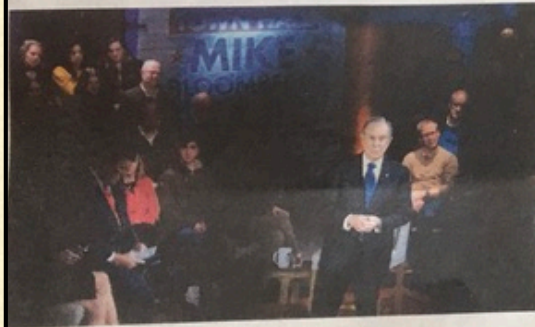
DEMOCRATIC PRESIDENTIAL contender Michael Bloomberg asks a question during a live televised town hall event in Manassas, Virginia, on Monday.

In his victory speech, the prime minister said he would form a national government. He did not