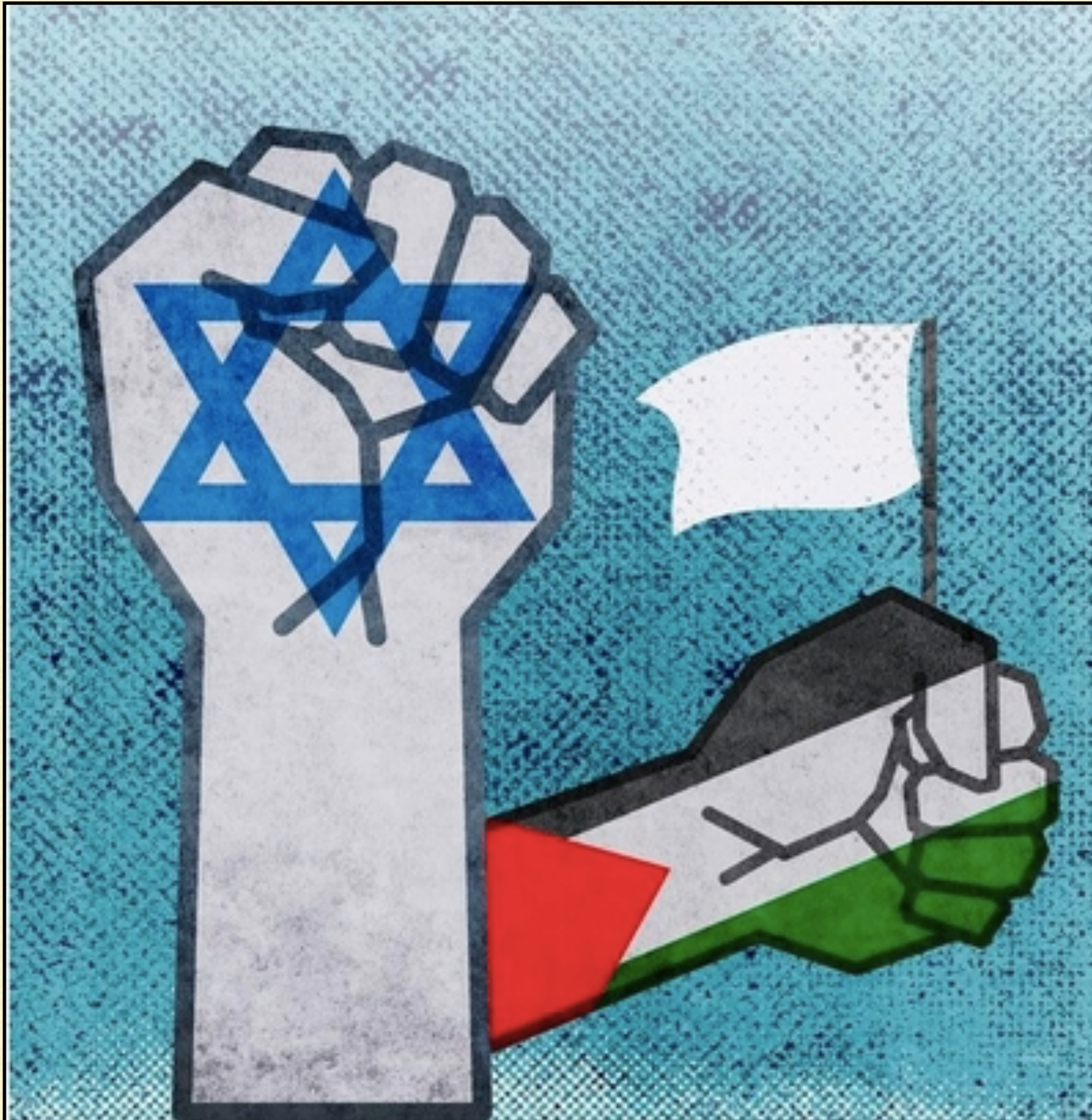
Ending the Israeli-Palestinian Conflict Illustration by Greg Groesch/The Washington Times

ANTI-SEMITIC WORLD PERSPECTIVE ANTI-ZIONIST FATAH HAMAS HEZBOLLAH ROCKETS GAZA SDEROT TERRORISM BRAINWASHING WASHINGTON TIMES N.Y.TIMES CNN AL JAZZERA LIBERAL LEFT DISPROPORTION RESPONSES